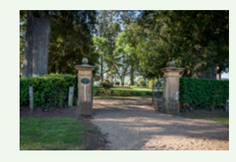
200 Anambah Road Maitland NSW 2320